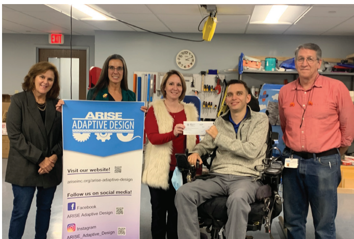
Romano Cars supports Adaptive Design