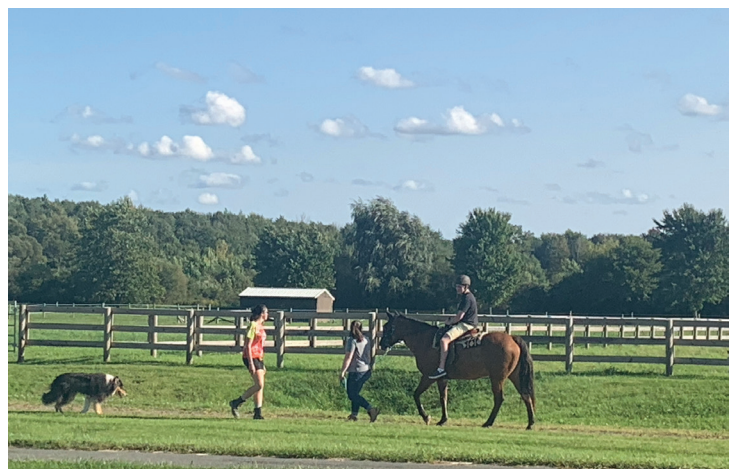
Odd Fellow and Rebekah Benefit Fund supports ARISE at the Farm