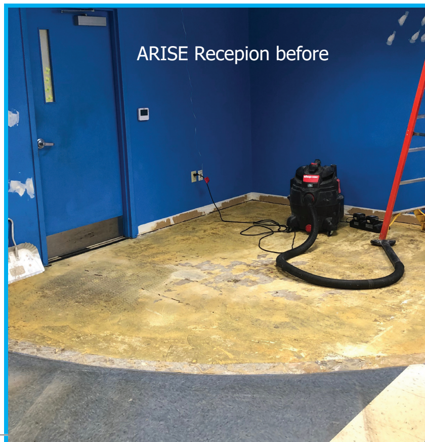
ARISE Reception before

We celebrated our 40 year anniversary in 2019, and we know we've got plenty more to accomplish.