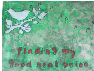
Finding My Good Neat Voice by Sujit Kurup.....$50