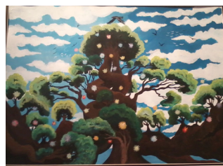
Fairy Tree by Charles FitzPatrick.....$3500