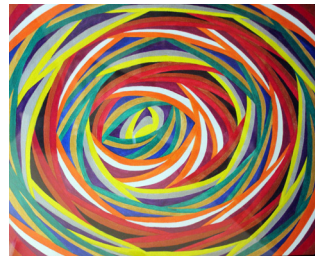
The 11th by Kimberly Harvey...$886