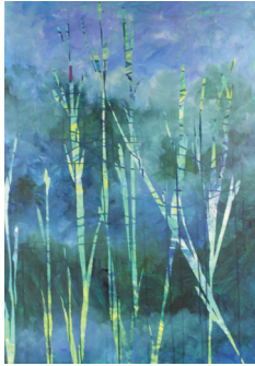
Adirondack Morning by Constance Avery....$400