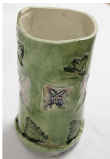
Butterfly Vase by Erica Vitthuhm...$200