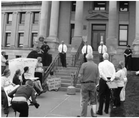
Advocates rally at the Courthouse in 2009.

For quite some time, the Madison County Courthouse in Wampsville has been the only non-accessible courthouse in New York State. ARISE and many community advocates raised this issue in 2009 when the courthouse celebrated its 100th anniversary. With strong action by advocates who initiated a private ADA Title II lawsuit, a settlement agreement has been reached that will make the courthouse accessible to people who have mobility impairments.