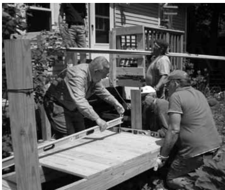
Volunteers at work building ramps.